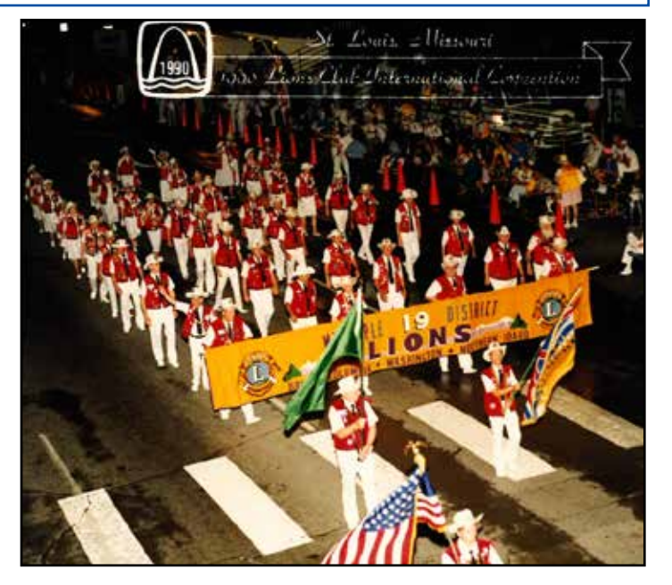
30 years ago Lions march in St. Louis! How many of you remember being there?

The MD19 Office will be closed December 23rd – January 1st. The Office will be open for business at 8:00 am on January 4, 2021.