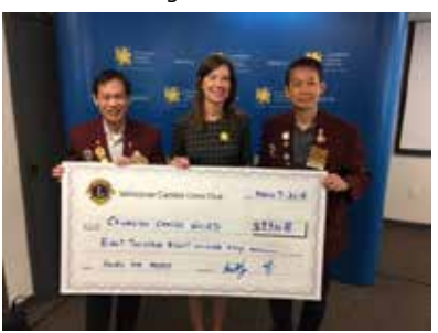
The A2 North Shore, Sea-to-Sky Lions Clubs are making a big difference with Cops for Cancer Tour de Coast by engaging their members and communities in supporting the dedicated cyclists as well as the kids and families served through pediatric cancer research and programs funded by the Canadian Cancer Society and supporters like you. In 2019, their zone project raised $11,885 by soliciting donations for Daffodil Pins, selling raffle tickets, and hosting fundraisers in support of their local riders. In addition, the Ambleside Tiddlycove Lions Club continued the tradition of hosting the Cops for Cancer 60 riders and crew members for dinner on their first night of tour.

The Lions Clubs are widely known across North America and internationally as a global "force for good". Their dedicated clubs and community champions continue to further and promote our partnership, helping us impact the lives of people affected by cancer even more. Thank you!