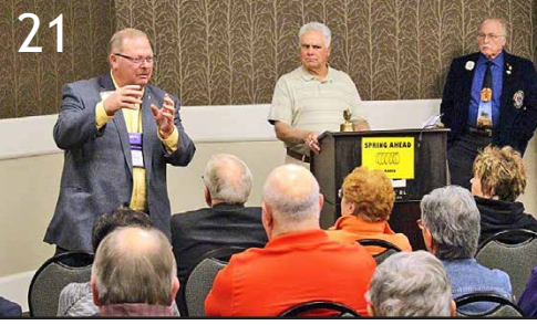
Faces of an MD19 Convention 1. Strides Walk 2. Great Party Friday Night 3. 15-16 CARE Donations presented 4. Int'l. Pres. Certificate of Appreciation 5. I'll Huff and I'll Puff 6. The Costume Winner 7. A Leadership Medal 8. So many raffle choices 9. Intro of Bobbin 10. Awesome DJ for Dancing 11. CC Nominations 12. Council Meeting 13. Dangerous Dudes 14. C&A Report 15. Face of Fun 16. Great Hats 17. 19-C Lions enjoy the delicious food 18. Lions protect environment 19. 19-G Banner 20. "Oh, Say Can You See ..". 21. Spring Ahead Membership discussion.