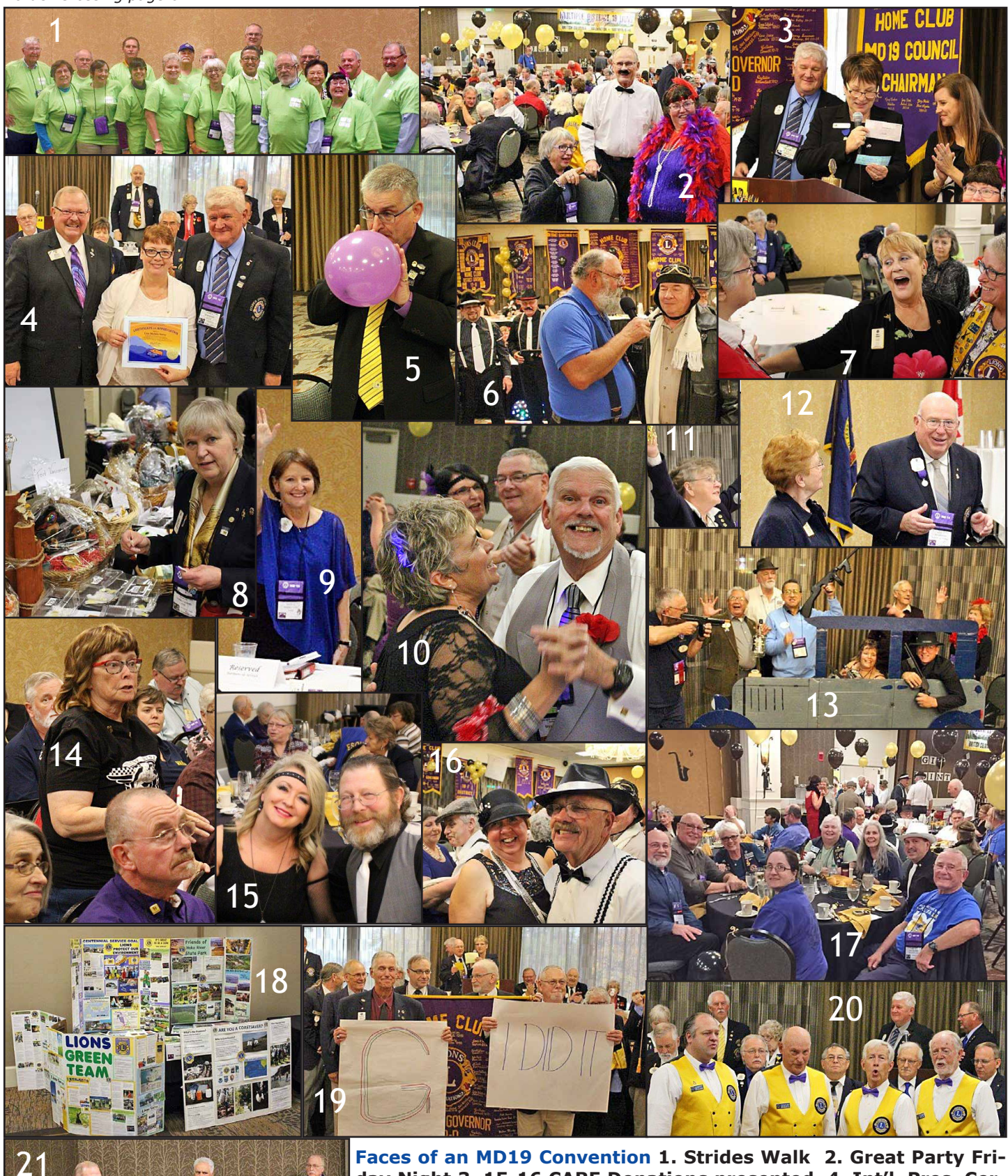
Border Crossing page 6