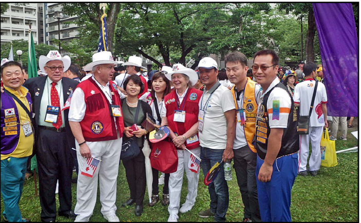
Celebration in the Park at the Lions International Convention in Fukuoka, Japan.

The thank you letter received was to all of the MD19 Lions Clubs that donated to assist the people of Fort McMurray. They will endeavor to follow-up this letter with notes of appreciation sent to each of the clubs and or individuals that were so kind in their donations. They are going to try to describe how the money is to be used for necessary repairs and specific rebuilding projects.