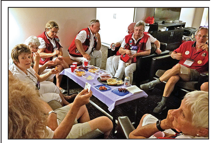
After the Parade

Vancouver Diamond Lions Club, A-7 Burien Lions Club, B-5 Gig Harbor Lions Club, C-1 University Place Lions Club, C-1 Olympia West Lions Club, C-2 Mineral Lake Lions Club, C-5 Yakima West Valley Lions Club, F-1 Longview Pioneer Lions Club, G-1 Clallam Bay Sekiu Lions Club, I-1