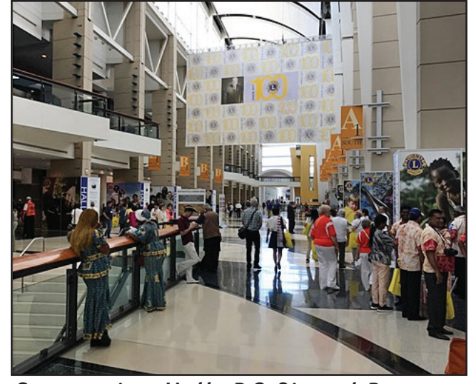
Convention Hall: DG Signed Banners