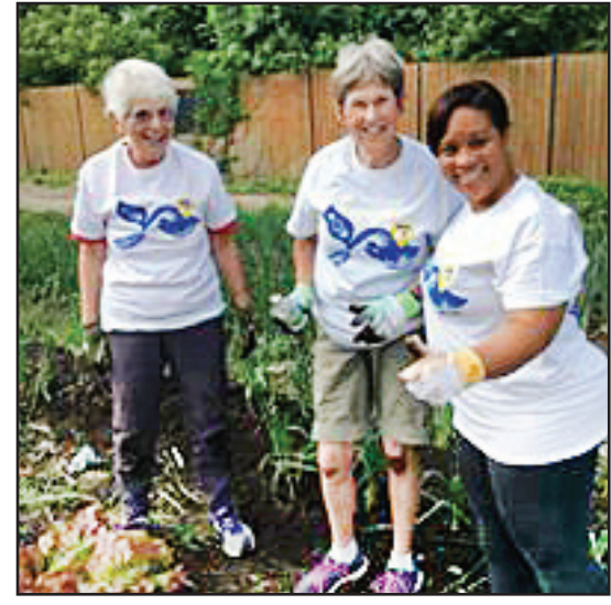
MD19 Lions Serving at the