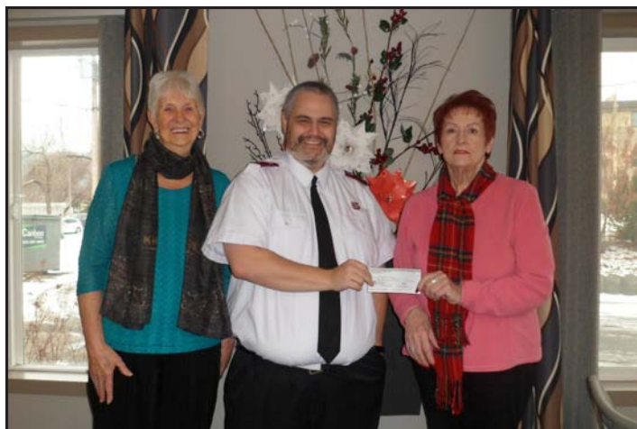
Williams Lake Lioness presenting a cheque to the Salvation Army