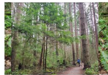
The Lions Legacy Tree Planting Program – District 19H